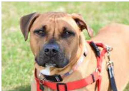
Ralphie is one photogenic pooch! When he is not posing for the camera he is busy on adventures to the lake or in the woods with his Mom.