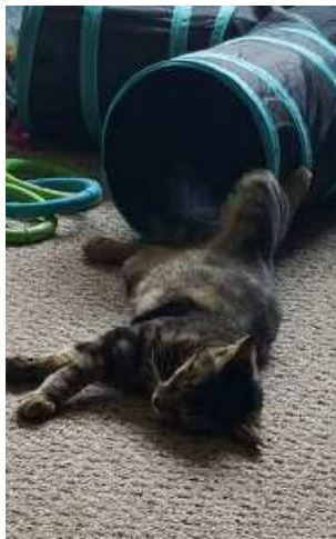
Once Sven aka Lynx burns off all his kitten energy racing around his tunnels he can, and will, sleep anywhere!