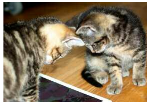
Technology is not just for humans. The center's feline residents, big and small just love to play on iPads.