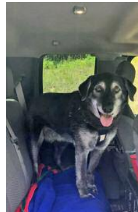
Sweet Buddy found his match quickly with an active guy who was ready for a canine companion to enjoy car rides, walks and snuggles on the couch! Buddy, you are one lucky dog! Enjoy your new adventure and new truck!