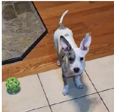
Bonsai is growing into his ears and his new life, complete with a fur sister to show him the ways of the world!