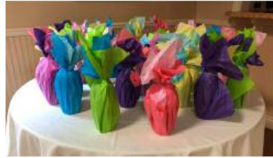
Art took over the Pelican Event Room this summer with a wine and art auction. Many wonderful local artists donated one of a kind pieces to help raise funds for the animals. Wine and appetizers from the Blue Pelican made for a great night.