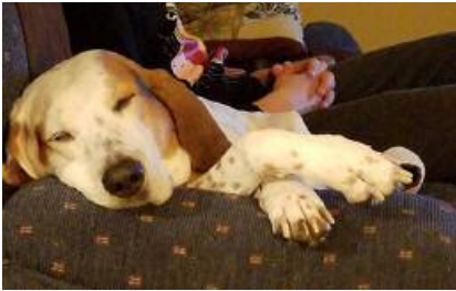
Daisy Mae has a ruff life, napping on couches and snuggling with her family!!