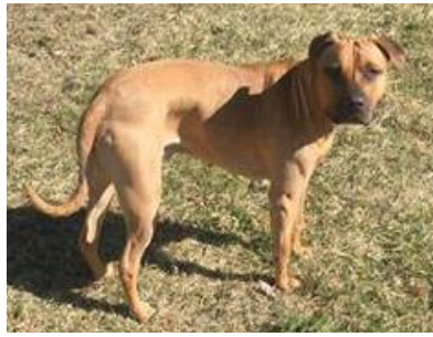
Ralphie never wants for a thing now. Walks, trips to beach, you name it, he is set!